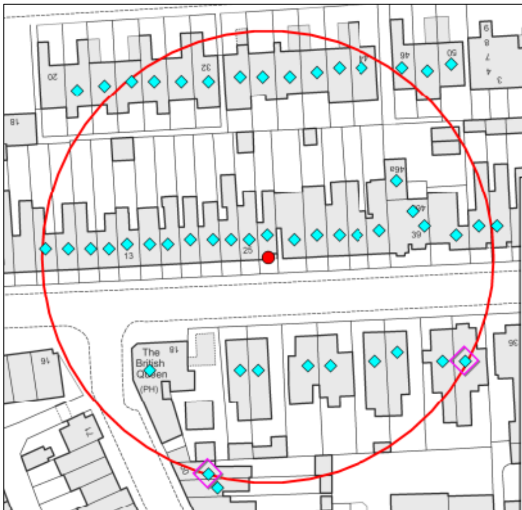
Figure 3 - Existing HMOs within 50m of the application site