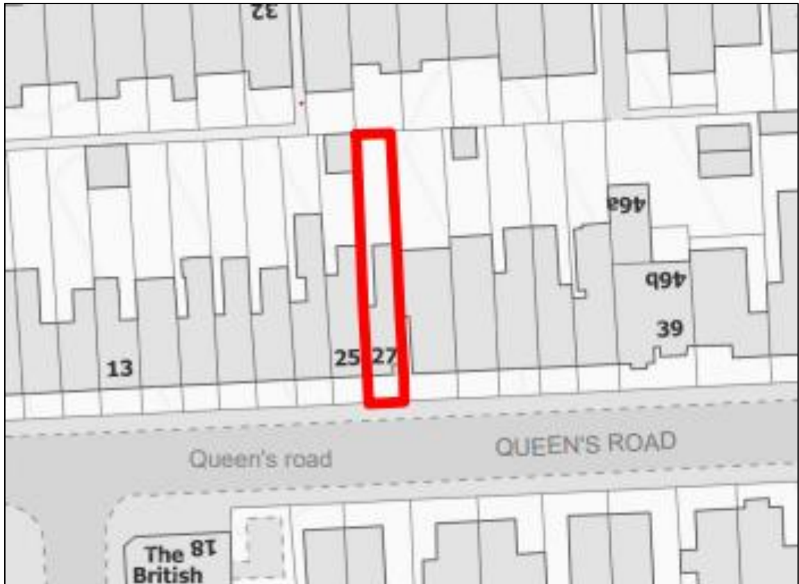
Figure 1 - Site Location Plan